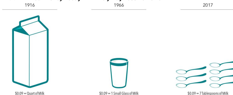
Exhibit 1. Your Money Today Will Likely Buy Less Tomorrow

In US dollars. Source for 1916 and 1966: Historical Statistics of the United States, Colonial Times to 1970/US Department of Commerce. Source for 2017: US Department of Labor, Bureau of Labor Statistics, Economic Statistics, Consumer Price Index—US City Average Price Data.